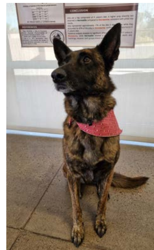
Good dog, Gren.